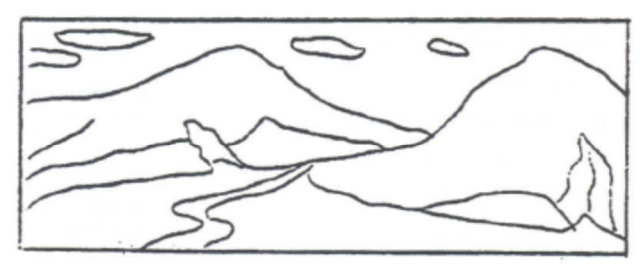
Figure 1 illustrates how a location may look.